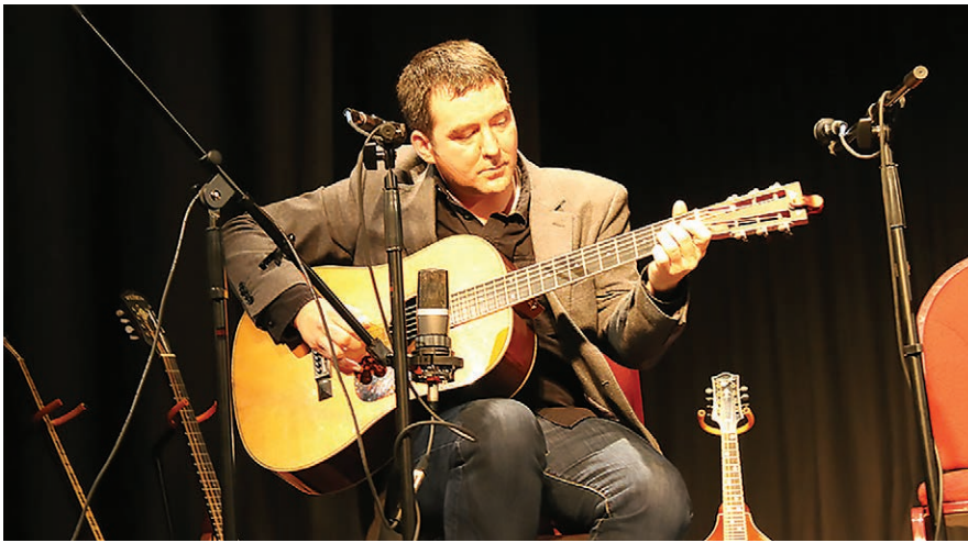
The Great North Woods Committee for the Arts brought the award-winning Cape Breton band Còig to the Tillotson Center in Colebrook, NH. The five-member band played new and traditional holiday music to a sold-out crowd.