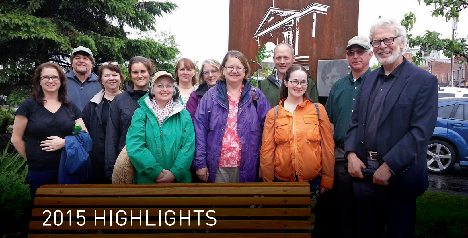
Grantee Learning Community members gather in front of one of the historical figures on the Pioneer Trail, located near the Pavillon des arts in Coaticook, Quebec. Funded in part by the Neil and Louise Tillotson Fund, the Table de concertation culturelle's walking trail is popular with tourists and local residents.