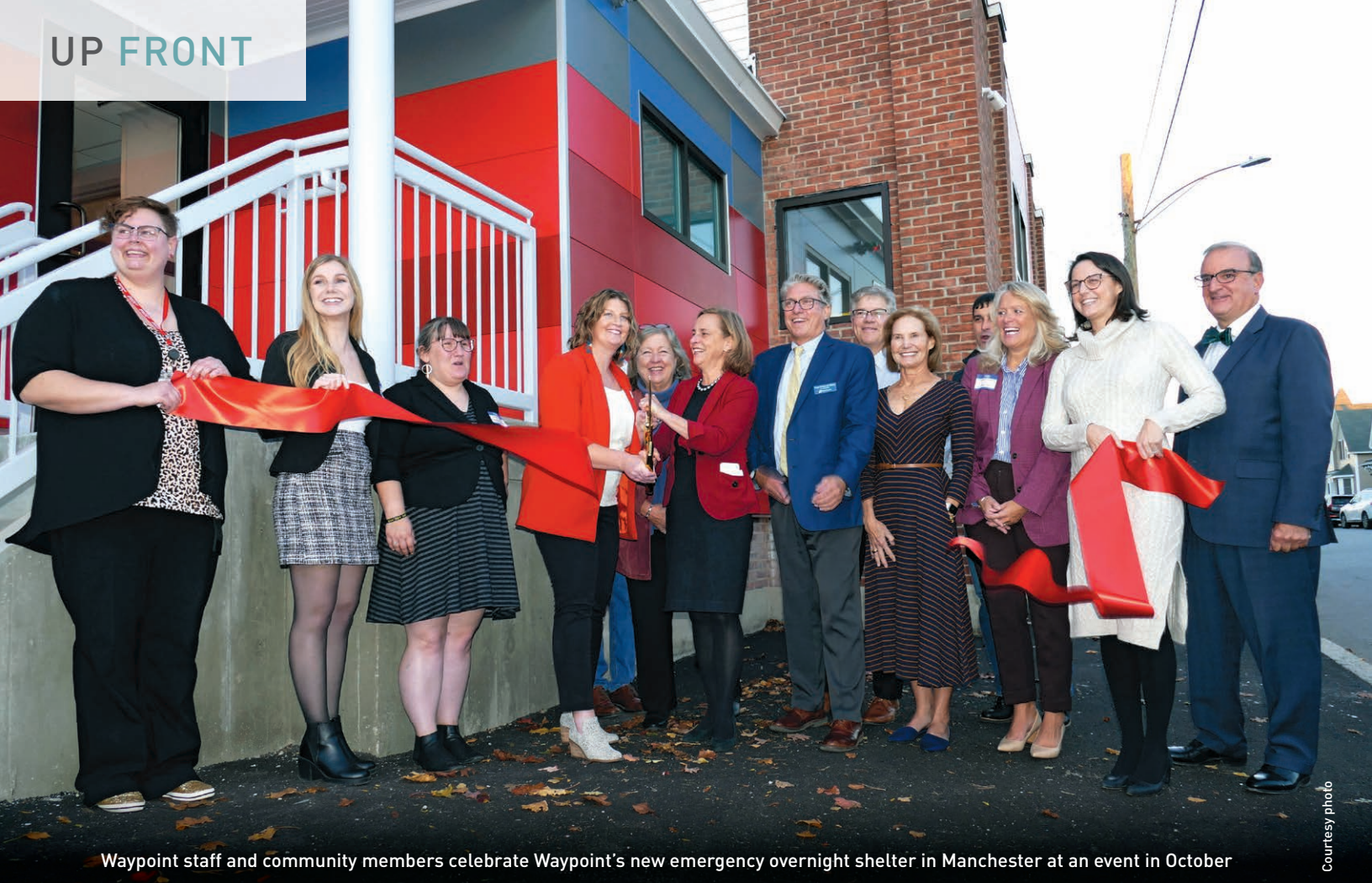
Waypoint staff and community members celebrate Waypoint's new emergency overnight shelter in Manchester at an event in October